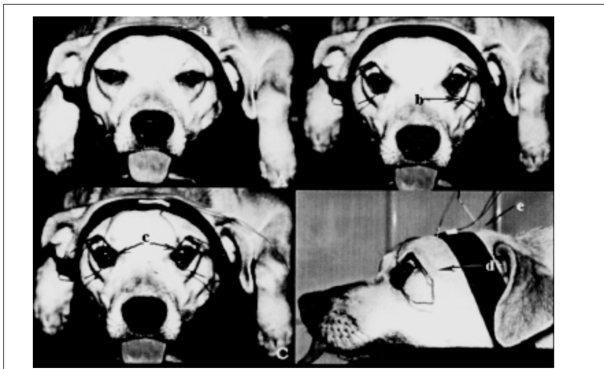
Figure 3 - Photographic image of a dog submitted to electroretinography. In A, one can see the fixation of head on the support with a velcro (a). In B, fixed blefarostate (b). In C, fixation of ERG-jet® electrodes on corneal surface (c). In D, lateral image with evidence to the positions of needle electrodes reference (d) and ground (e).

According to the experience accumulated since the implantation of the electroretinography services, it is possible to conclude and advise: the