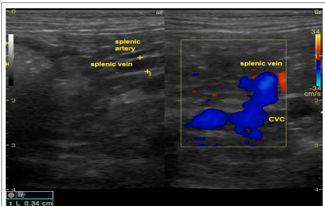
Figure 2 - Color Doppler ultrasonography showing shunting vessel between splenic vein and caudal vena cava.

Those dogs with normal values of blood flow velocity at main portal vein before shunt presented