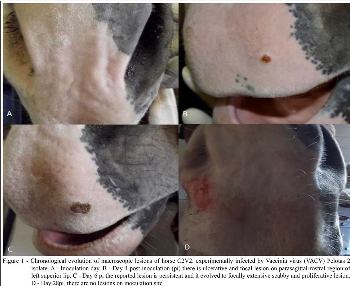
Figure 1 - Chronological evolution of macroscopic lesions of horse C2V2, experimentally infected by Vaccinia virus (VACV) Pelotas 2 isolate. A - Inoculation day. B - Day 4 post inoculation (pi) there is ulcerative and focal lesion on parasagittal-rostral region of left superior lip. C - Day 6 pi the reported lesion is persistent and it evolved to focally extensive scabby and proliferative lesion. D - Day 28pi, there are no lesions on inoculation site.

compared with infections caused by a single VACV isolate (CARGNELUTTI et al., 2012a). In contrast to observed in rabbits and mice inoculated with VACV-P1V and P2V, our results showed that horses inoculated with the same isolates presented milder lesions, and did not die after virus replication.