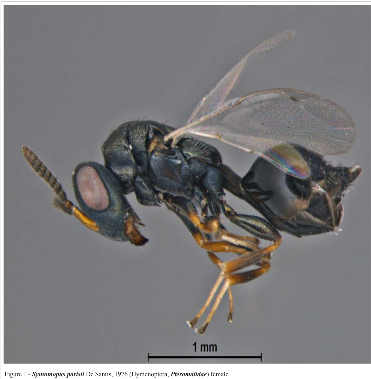
Figure 1 - Syntomopus parisii De Santis, 1976 (Hymenoptera, Pteromalidae ) female.

Bouček, 1993 is known only to the United States and its host is Walshia amorphela Clemens, 1864 (Lepidoptera, Momphidae ) (BOUČEK, 1993); this author; however, considered the host record unusual, given the biology of the other species of the genus. Basing on known records for Leptomeraporus species and the present findings, the secondary parasitism on other Hymenoptera is a possibility. Leptomeraporus ornatus was described based only on males (BOUČEK, 1993) and the male specimens obtained in this study agree well with the original description. However, in the opinion of Dr. Steven