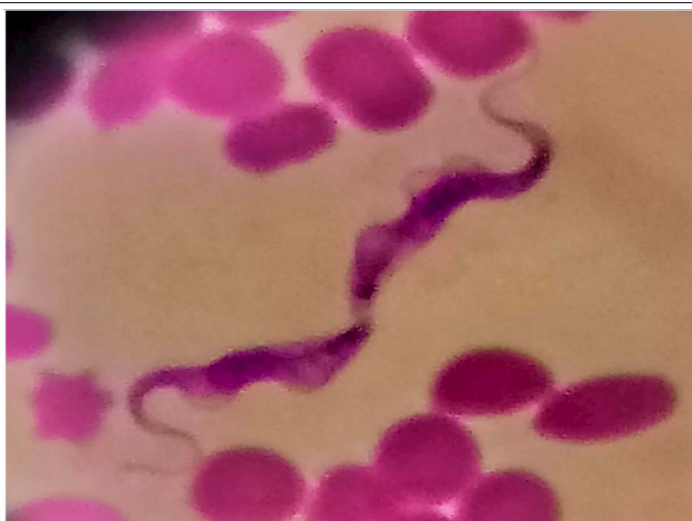
Figure 2 - Microscopic identification with Diff-Quick staining to 100X of Trypanosoma sp. in blood smears of sheep of the canton Salitre (Guayas) from Ecuador, analyzed between October 1, 2019, to February 19, 2020.

(DESQUESNES et al. 2013; GIORDANI et al. 2016). Trypanosoma spp. affect different species of domestic and wild animals, such as horse, mule, donkey, camel, cattle, buffaloes, sheep, goat, dog, pig, elephant, deer, fox, tiger and jackal (KUMAR et al. 2015).