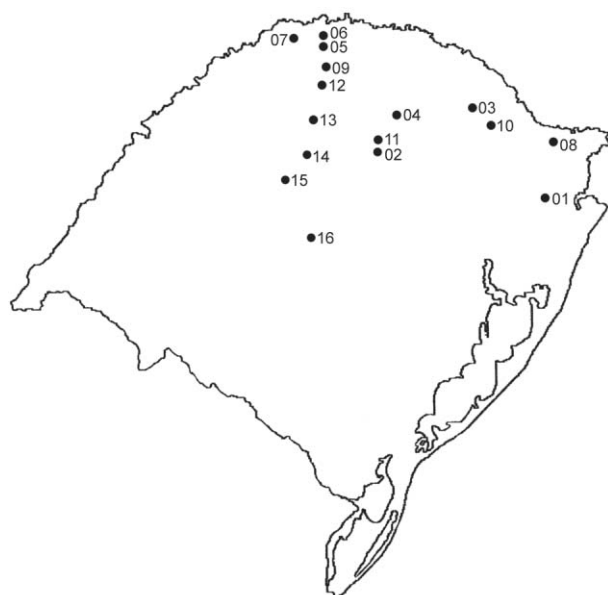
Figure 1 – Map of Rio Grande do Sul State, Brazil, with the collection sites of T. riograndense accessions detailed in Table 1: 01 - São Francisco de Paula (accessions 01, 11, 50, 53, 59, 66, 67, 71, 72), 02 - Mormaço (accession 03), 03 - Lagoa Vermelha (accessions 10, 41), 04 - Passo Fundo (accessions 15, 21), 05 - Seberi (accession 17), 06 - Frederico Westphalen (accessions 18, 42), 07 - Tenente Portela (accession 19), 08 - Bom Jesus (accession 20), 09 - Boa Vista das Missões (accession 23), 10 - Muitos Capões (accession 29), 11 - Tio Hugo (accession 30), 12 - Palmeira das Missões (accessions 33, 43), 13 - Panambi (accession 45), 14 - Cruz Alta (accession 46), 15 - Tupanciretã (accession 47), 16 - Itaara (accession 49).

lined with moist filter paper. Seedlings were transferred to styrofoam containers with commercial substrate and later to plastic cups with garden soil. In August the young plants were transferred to plastic pots with 1.25 kg of garden soil. Finally at the end of September, they were planted in plastic boxes (34 cm × 14 cm × 11.5 cm) with garden soil, one plant per box. The boxes were arranged in a field area (30° 02' S, 51° 13' W) in Porto Alegre, state of Rio Grande do Sul, Brazil, in a completely randomized design, with ten repetitions. Each box was considered as an experimental unit.