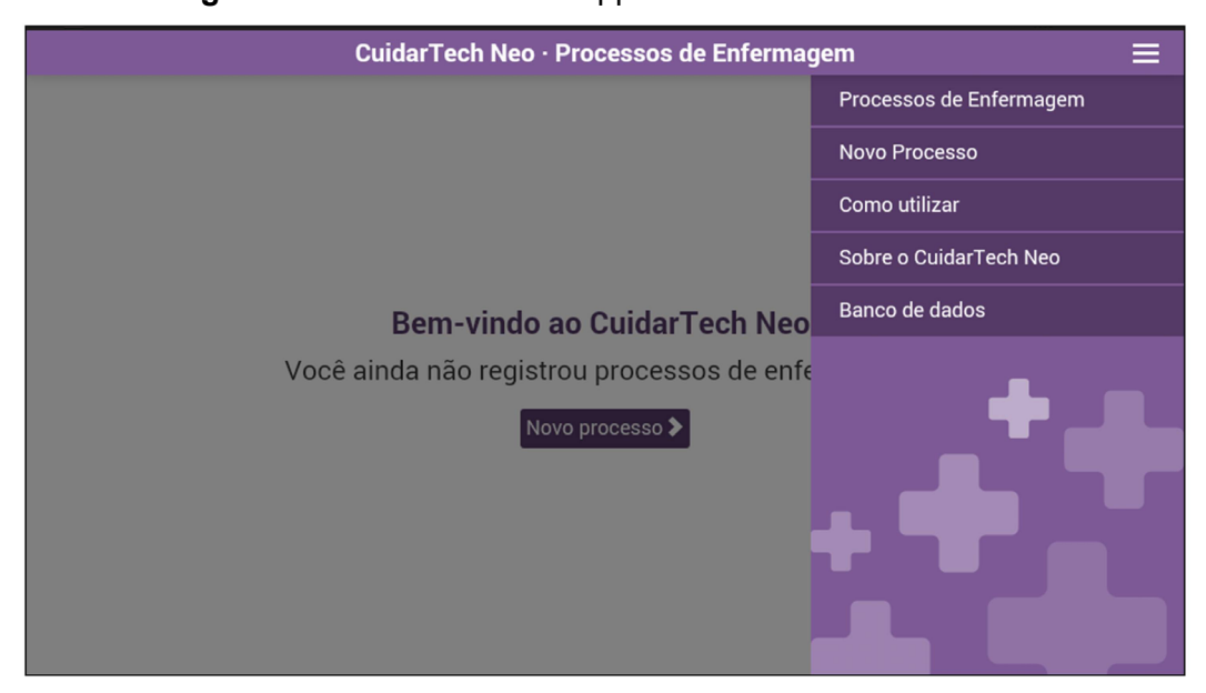
Figure 2 - CuidarTech Neo Application Menu Tab

After accessing "Novo processo", the " Identificação do bebê " ("Baby Identification") (Figure 3) screen is triggered and thus patient identification data can be added. After filling in the identification data, pressing the button at the bottom of the " Iniciar processo " ("Start Process") screen displays the NHBs for the Nursing History execution.