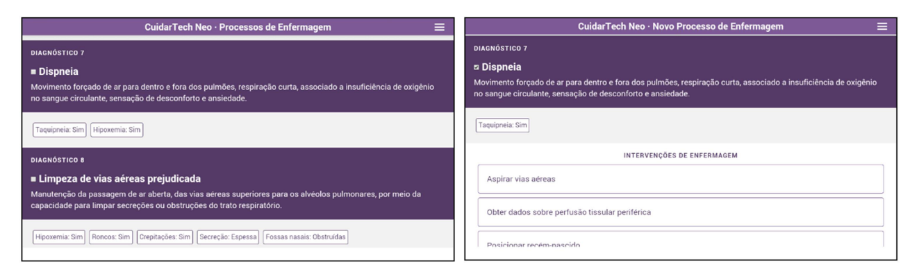
Figure 5 – Diagnósticos de enfermagem (Nursing diagnosis) screen and integration between nursing Diagnosis and nursing care interventions in the CuidarTech Neo app

When the nurse uses clinical judgment and selects the desired diagnosis by pressing the checkbox button, the " Intervenções de enfermagem " ("Nursing Interventions") related to that diagnosis are displayed.