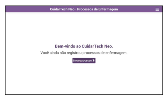
Figure 1 - CuidarTech Neo App Launcher Icon and Screens