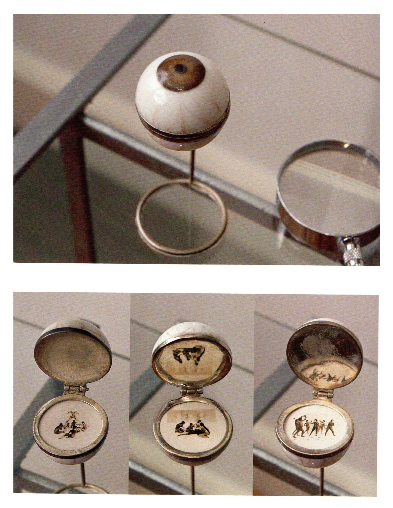
Figure 4 - "Testemunhas Oculares X, Y, Z". Adriana Varejão<sup>9</sup>.