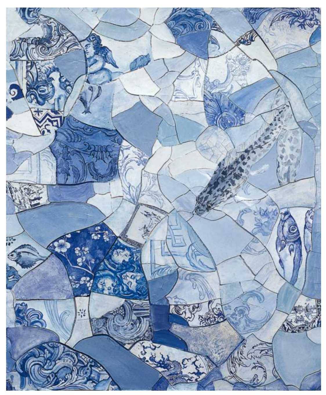
Figure 1 - "Naufrágio da Nau da Companhia das Índias"1.

This article deals with shipwreck inspiration (Figure 1). About the voyage of a pirate ship that, launched into the seas of nursing research, seeks intertextuality and escapes police espionage, i.e., the limits of thought that navigation must follow routes already traced in this area of knowledge. In this regard, this article presents clues from a research-essay, a navigation exercise that articulated different fields of production, such as contemporary art, philosophy, social sciences and nursing. In this dialogue between different areas of knowledge, an ethical-aesthetic essay was produced that seeks to reflect on how we became what we are, in practices of writing memorials by professors who are professors at a Brazilian Nursing School.