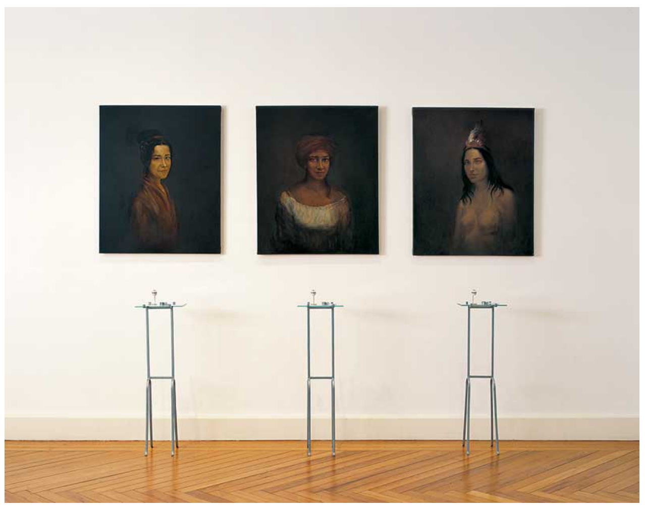
Figure 3 - "Testemunhas Oculares X, Y, Z"9.

In memorials, full professors reinforce certain identities, as in the work " Testemunhas Oculares X , Y , Z "<sup>9</sup> (Figure 3). The legacy of a work trajectory that begins in care and gradually migrates to teaching, presents a table written in the guise of a care-professor, care-nurse, nurse and professor, professor and nurse.