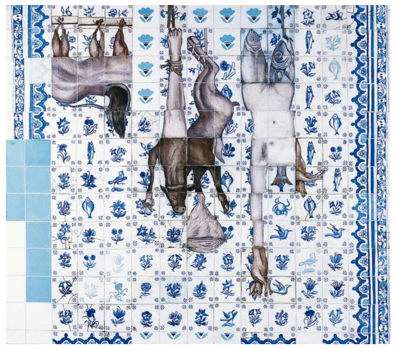
Figure 2 - "Azulejaria de Cozinha com Caças Variadas"<sup>4</sup>.

smooth and isolated surfaces of a butcher shop<sup>5</sup>. In the kitchen of varied game, creating seeks to (de)naturalize the look, its obstinacy for the whole and the universal, in order to present a multiple in details, surfaces and differences, to multiply meanings.