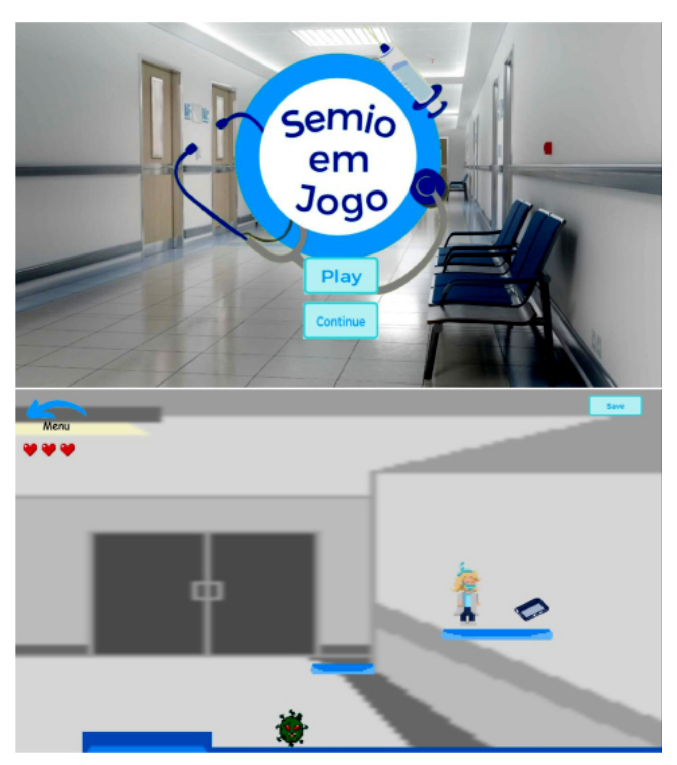
Figure 2 - Some scenes from Semio em Jogo®. Cuité, PB, Brazil, 2022.

With regard to the playability evaluation, considering the sociodemographic and academic characterization data, there were 62 students, of whom 35 (56.5%) participated in the evaluation of the preliminary version and 27 (43.5%) did so after implementing adjustments. In the first group there were 6 (17.1%) men and 29 (82.9%) women, whereas 5 (18.5%) men and 22 (81.5%) women were observed in the second group.