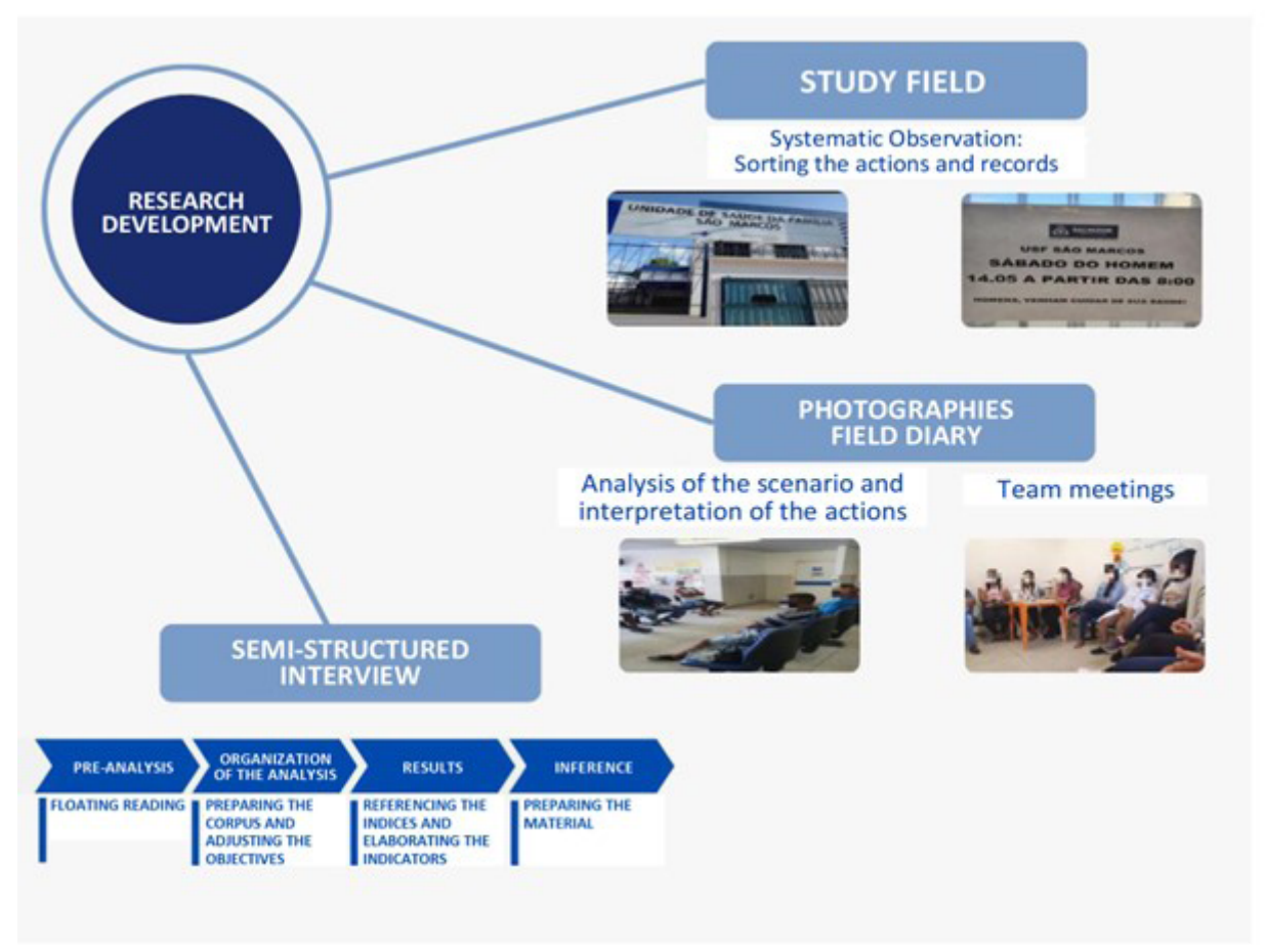
Figure 1 – Description of the stages in the research development. Salvador, Bahia, Brazil, 2023.

Below is a Figure 1 depicting each stage in the research development.