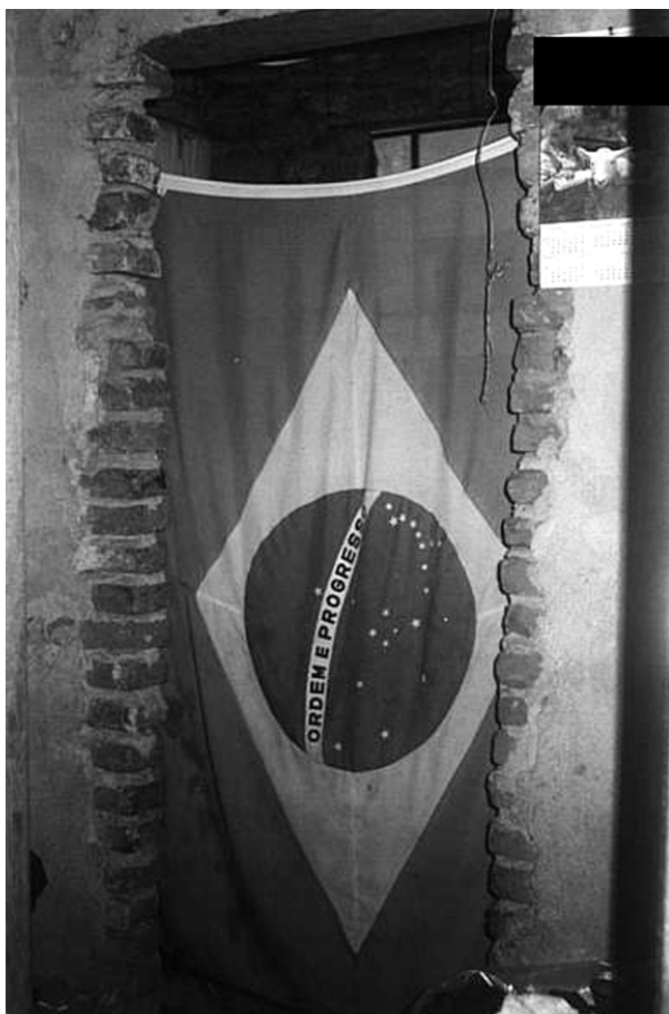
Figure 3 – The bathroom doorway in the house, covered with the national flag

The ecologic perspective used in the present study constitutes a theoretical approach which helped us not only to comprehend the amplitude and complexity of the study universe, but also to describe and explain the effects of the ecosystem in each family member (6) .