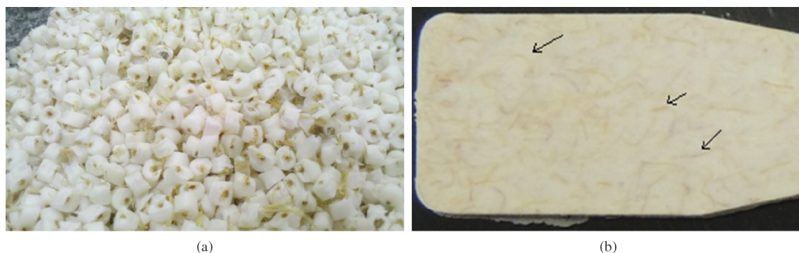
Figure 1. Photography of PLA/PBAT + Juta fibers pellets produced by coupled device extruder (a); Photography of PLA/PBAT + Juta fibers sample produced by injection moulding (b).