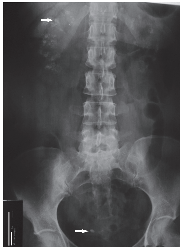
Figure 1 – Abdominal X-ray of the patient showing clustered calcifications in projection of the kidneys, more evident at the right side (upper arrow identifies one of these clusters). An 8-mm right distal ureteral stone is present (lower arrow).

Nephrocalcinosis is usually identifiable by X-ray, but both ultrasonography (US) and computed tomography (CT) can detect it earlier than ordinary abdominal X-ray 1 . US is considered to be an excellent diagnostic method for detection and monitoring of nephrocalcinosis 3 . The finding of hyperchogenic pyramids with a