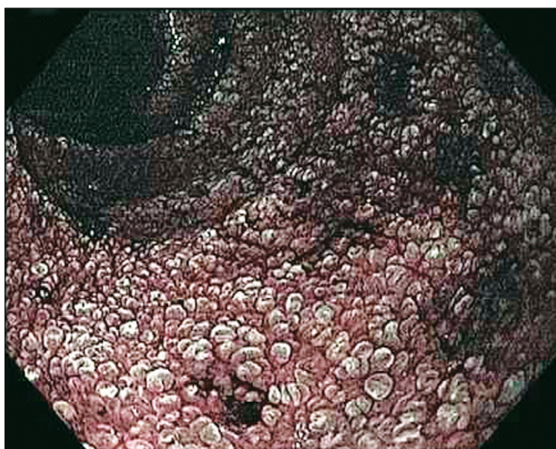
FIGURE 2 At close inspection with narrow-band imaging (NBI), enlarged and rigid duodenal villousities are seen.

of gastrointestinal impairment include abdominal pain, diarrhea, bleeding, nausea and vomiting. Diagnosis is challenging due to non-specific clinical features, and can be done by biopsy of suspicious changes at upper endoscopy. 5