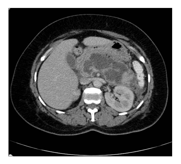
FIGURE 2 CT scan performed 10 days after admission, showing fluid collection and necrosis (WON).

These collections can be intra or extra-hepatic and may contain solid material with varying amounts of liquid. Chronic collections are those occurring after four weeks from the initial presentation and include pancreatic pseudocysts and WON. Pseudocysts usually develop adjacent to the pancreas, and they are homogeneous and filled with fluid.