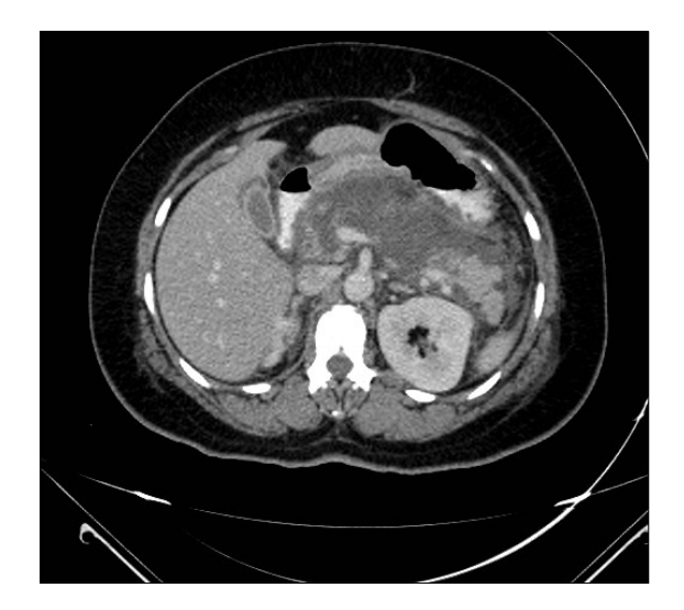
FIGURE 1 CT scan 48 hours after admission, showing edematous acute pancreatitis.