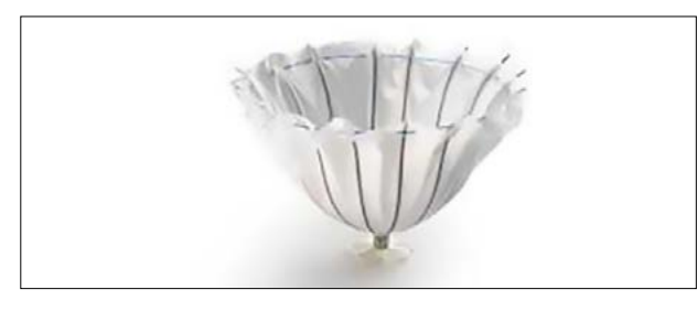
FIGURE 1: PARACHUTE®

Medline (via PubMed), Cochrane collaboration, Lilacs, Scopus and Web of Science, covering the period from January 2002 to April 2016. There were no restrictions of language in the bibliographic searches. The searches were updated monthly until the completion of the study (October 2016) in order to capture possible scientific productions that had been published later on.