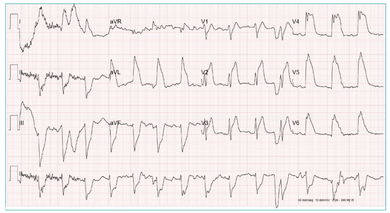
Figure 1. Electrocardiogram of admission showing ST segment elevation in V2-V6.

AS: Data Curation, Writing – Original Draft. TL: Data Curation. LP: Data Curation. RL: Data Curation. PG: Data Curation, Investigation. TS: Data Curation. GB: Conceptualization. FP: Investigation. TP: Data Curation. TP: Visualization. AF: Data Curation. PS: Data Curation. DT: Investigation. CD: Data Curation. FG: Investigation, Validation. SS: Supervision. CC: Supervision. RKF: Supervision. PRS: Writing – Original Draft.