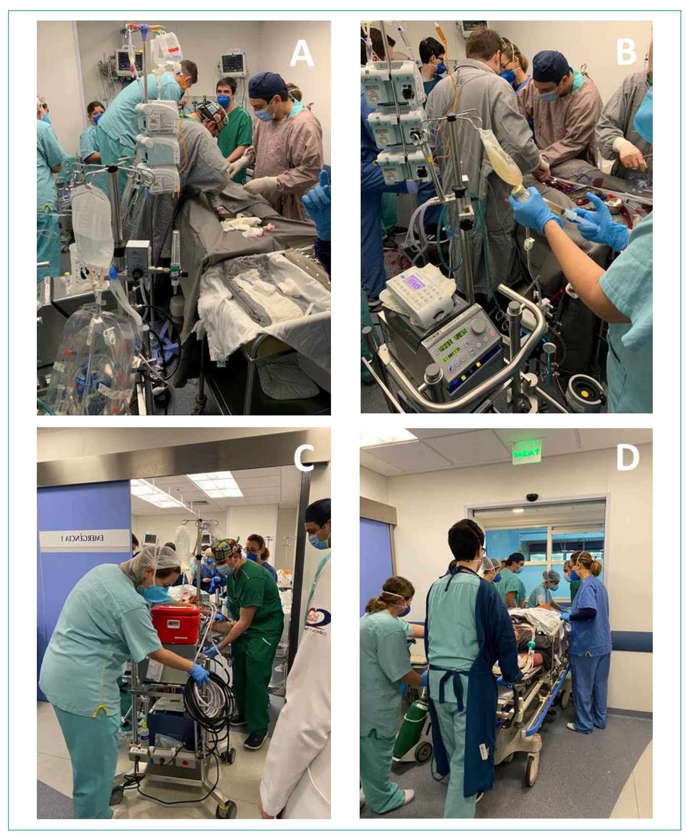
Figure 2. (A) Medical team performing cardiopulmonary resuscitation during femoral dissection and cannulation of venoarterial extracorporeal membrane oxygenation under direct view inside the emergency room; (B) End of cannulation, interruption of chest compressions and cannula fixation; (C) Preparation of the patient in extracorporeal membrane oxygenation for transport to the hemodynamics sector; (D) Patient being effectively taken for cardiac catheterization using venoarterial extracorporeal membrane oxygenation.