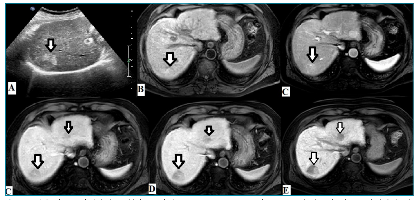
Figure 2. (A) A hyperechoic lesion with hypoechoic areas at segment 7 on ultrasonography (another hyperechoic lesion is not shown). (B) The lesion is slightly hyperintense on the axial T1-weighted image. (C), (D), and (E) Axial T1-weighted image shows arterial hyperenhancement and wash out in portal and venous phases. (E) Hepatobiliary phase lesions are hypointense. Images of a 70-year-old man with hepatocellular carcinoma.

Incidentally detected hyperechoic zones may not necessarily be detected on MRI secondary to mild focal hepatic steatosis or false interpretation of the radiologist. Although hemangioma is the usual suspect in the focal hyperechoic lesions of the liver detected on US, lesions requiring therapy must also be considered in the differential diagnosis. A thorough evaluation of these patients can be undertaken by acquiring detailed clinical data, scrutinizing sonographic and MRI findings, and performing a biopsy procedure if necessary.