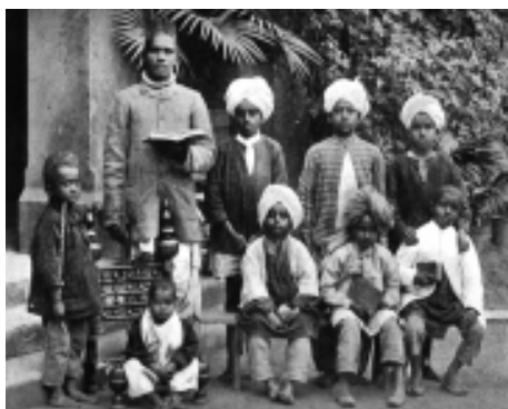
Figure 10: “A group of untainted boys at Tarn Taran, who are being saved from becoming lepers and are being trained for healthy and useful lives”.

The boys and girls are all taught to work as they would have to do, and as they will have to do, in their own villages. They work in the fields, sow and reap; ... and the girls are taught to do the most menial work, such as they will have to do in their own village homes. I saw Christian carpenters, Christian servants, Christians making bricks, Christians binding books, Christians at all sorts of employments. Gradually the whole place is becoming Christian. At first heathen had to be employed, but now they are all giving way to Christians. The whole face of the country is becoming changed, the heathen now, for very shame sake, giving up many of their heathenish customs. Heathen women are often ashamed to be seen wearing the extravagant ornaments on their feet and legs which they used to wear. Some of these anklets weigh as much as three pounds each. Heathen men are ashamed to be seen drunk, whereas they used to glory in it. They even ask pardon of the Christians for such conduct. The great heathenish drinking festivals, which used to be the most terrible orgies, and would last for weeks at a time, are now comparatively tame affairs, and do not last so many days. Owing to the strenuous efforts of the missionaries, the great majority of the licensed liquor shops, which were fast ruining these simple-minded aborigines, have been done away with.