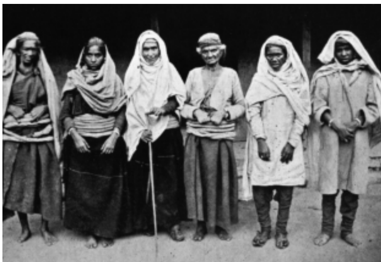
Figure 3: "Leper Women, Chamba Asylum" (Source: Jackson, 1911).