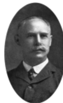
Figure 4: John Jackson (Source: Jackson, 1911).