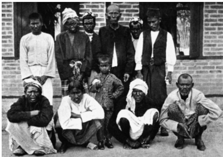
Figure 5: "Lepers in the Mandalay Asylum — representing seven nationalities" (Source: Jackson, 1911).

Bailey and Jackson's travel narratives in India served another rhetorical function for the Mission to Lepers. It must be remembered that, by the late nineteenth century, few people in the United Kingdom would know what a person suffering from leprosy looked like. By the late sixteenth century, leprosy was rarely seen in Europe, and certainly by the nineteenth century, outside of Norway, cases of leprosy were even more rarely encountered. What late nineteenth century British men and women would have known of leprosy was largely the product of cultural accretion, myth, and imagination. The imagination of leprosy strongly influenced Europeans' perception of the disease as 'An Imperial Danger,' and Bailey, Jackson, and the Mission to Lepers took advantage of these perceptions in describing their missionary efforts. Their often vivid descriptions, and accompanying photographs, made real what Europeans had only long imagined of leprosy (Figures 5, 6). Their descriptions of limb-less lepers who must be carried to receive communion, who lacked hands to receive the communion wafer, and who lacked lips to receive communion wine appealed to all emotional and spiritual sensibilities of their readers.