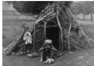
Figure 7: "Lost and lonely: a destitute Indian leper in Bombay Presidency" (Source: Bailey, 1924).

stone was laid to the Glory of God and the Help of Suffering Humanity." The photographs of patients with leprosy constitute a process by which the disease's sufferers were ascribed with more than "imaginary anatomies." They, in fact, describe the process by which lepers were