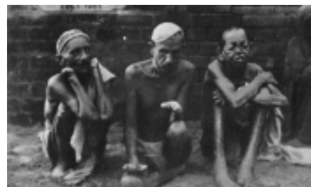
Figure 9: “Lepers at the Tarn Taran Asylum”.

The pre-dominant image of the leper that medical missionaries perpetuated, with severe facial deformities, auto-amputated limbs, and other features of advanced leprosy, was only the most uncommon sights in the field. Medical missionaries overlooked less conspicuous, less debilitating, and more common forms of leprosy (the tuberculoid form), in favor of rare and advanced cases (the lepromatous form), leaving their English audience with an indelible conclusion that all lepers appeared this way. In the process, the most abnormal forms of leprosy became, in the minds of readers, the normal. Portraying lepers and leprosy in this way served multiple ends. The images of lepers reiterated the inferiority and the backwardness of the native populations and underscored the need for British colonization. And for missionaries, the images served the practical issue of raising charity funds for evangelization and justifying their evangelical efforts among those whom “all but God had abandoned,” making real only what had been learned from biblical parables and from medieval stories of the banishment of lepers. Like the travel narratives that were a popular genre of literature in late Victorian society, the Mission's photographs of lepers would have served their audience's fascination and desire to ‘picture’ their empire as the historian James Ryan (1997) has claimed.