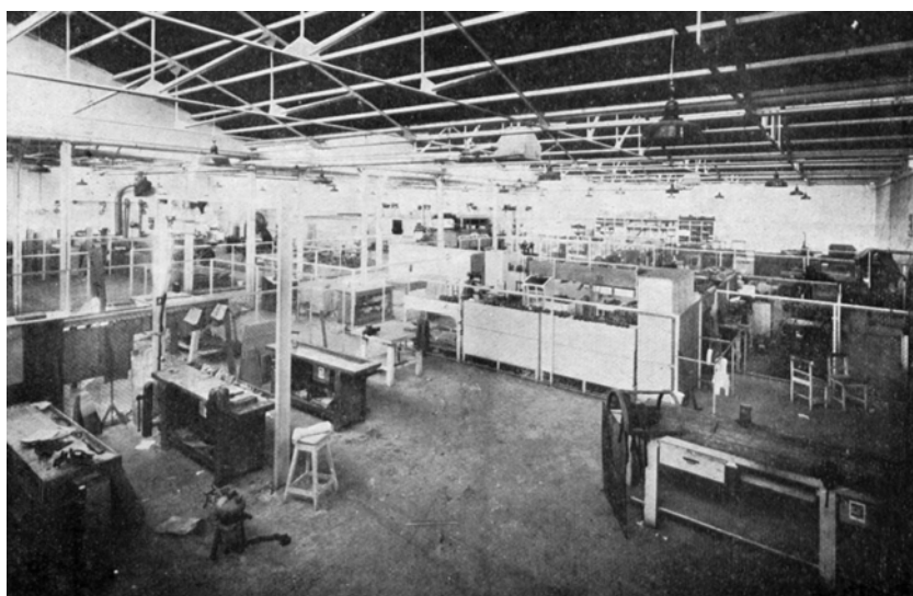
Figure 2 – School of Rehabilitation of the Institute for the Vocational Rehabilitation of Work-related Disabled. (Madariaga, 1931, Photo 11).