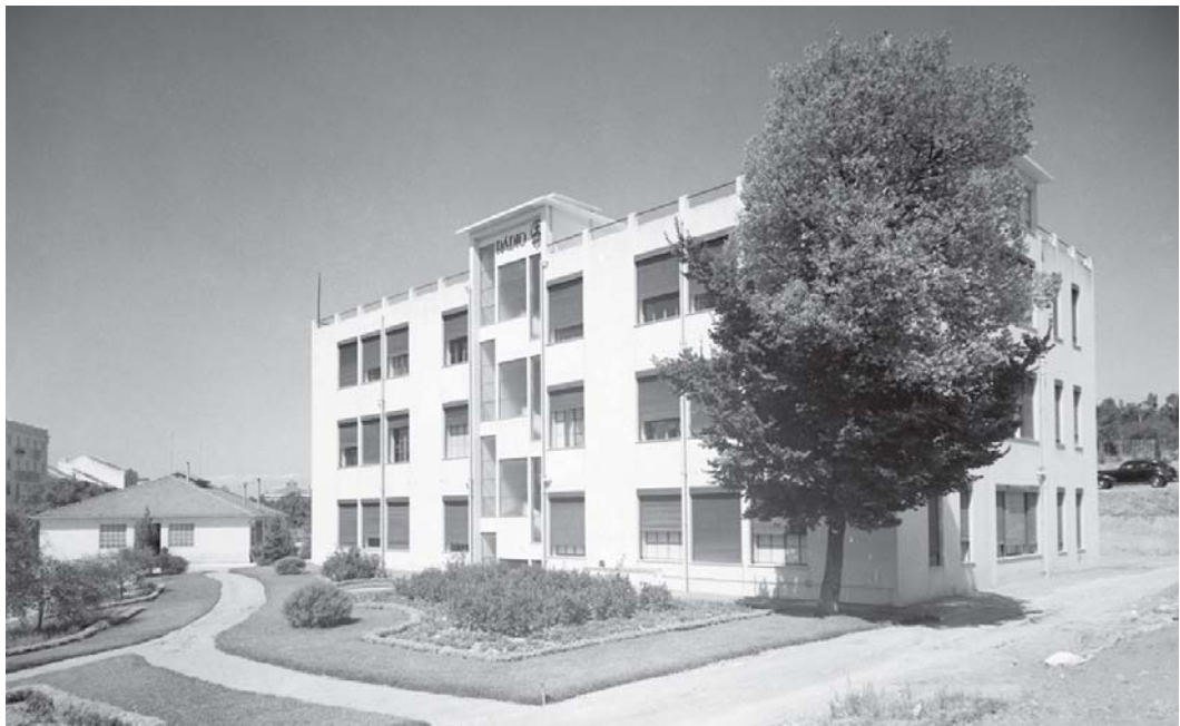
Figure 2: Radium Building – Portuguese Institute of Oncology (IPO) in the 1930s. It was in the laboratories of this building, inaugurated in 1933, that most of the experimental oncology work was done until the opening of the hospital block in 1948. The IPO was conceived above all as a center for oncological studies, for which purpose it was endowed with various laboratories, a library, an oncological museum and a scientific review which was to have international influence. Successively, there were established sections for pathology, histophysiology, experimental pathology and the culture of tissues, chemistry and physical chemistry, and even radiation physics. The Institute united under one roof the potential for carrying out any work on neoplasms in human beings, but also in animals and even plants, such conditions being necessary for both clinical and experimental studies.

It was from 1930 onwards that he devoted himself to the study of the lymphatic system through lymphography, but it was from 1937 that this researcher made the IPO his place of work, where he would develop his most relevant researches in the area of oncology. On the basis of the most advanced biological conceptions of the time, and above all experimental surgery, he concentrated on the role of the lymph nodes in the mechanisms of organic defense against neoplasms, their local invasions and systemic dissemination. A debate was going on at the time over the question of whether the dissemination of malignant tumors happened via the lymphatic and blood systems or through the peripheral nerve sheaths.