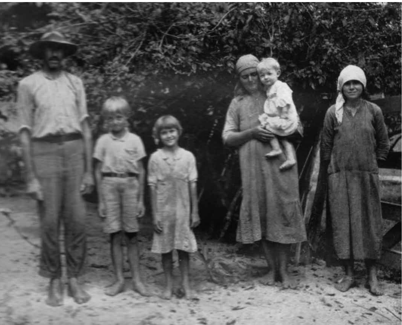
Figure 1: Family of settlers of average economic means. The children show visible signs of ancylostomiasis. On the other hand, no signs of hereditary degeneration are present (Giemsa, Nauck, 1939, plate XXIII, p.45)

The survey on the state of health of these settlers was followed by a demographic study of the colonial region in order to ascertain birth, death, and growth rates. Giemsa and Nauck (1939) conclude that German immigrants eventually adapted to their new environment and that their health suffered little damage. This adaptation, favorable settlement conditions, low mortality – despite the menacing climate and lack of hygiene – suggested that the families in question had a “hereditary predisposition and racial formation” that made them “highly resistant and strong” (p.53). Lastly, according to the authors, the “quality and history of the genetic heritage” of these families in light of their origin, their physical characteristics, and their intellectual and spiritual expressions, as well as their economic activities, would be tremendously valuable in research on “environment and race.” In this regard, the findings