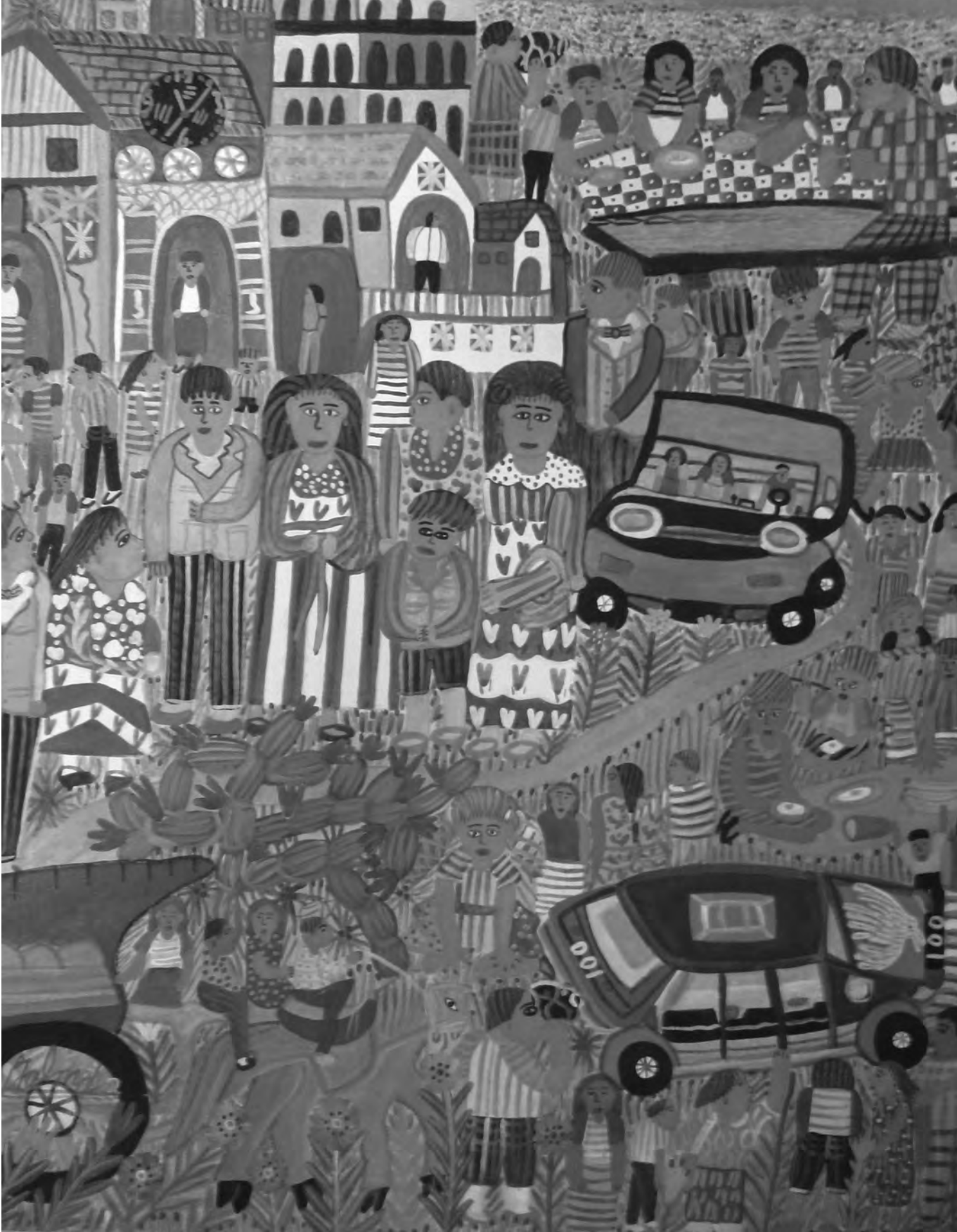
Figure 3: Painting of a funeral procession by Jacques Valmidor