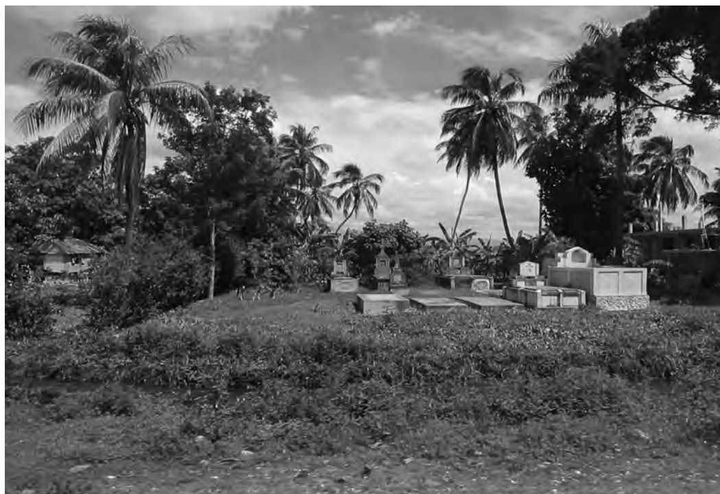
Figure 2: Photo of graves near homes on the road to the Southern health department (Haiti, July 2013)

For Haitians, the role of the dead is very important in everyday life, and death does not represent a possible final rest, but instead a door connecting two worlds. These cultural and religious aspects were seen in the wake of the 2010 earthquake, when burying the dead presented a significant problem, since the country's burial practices do not permit interment before the religious rituals are performed.