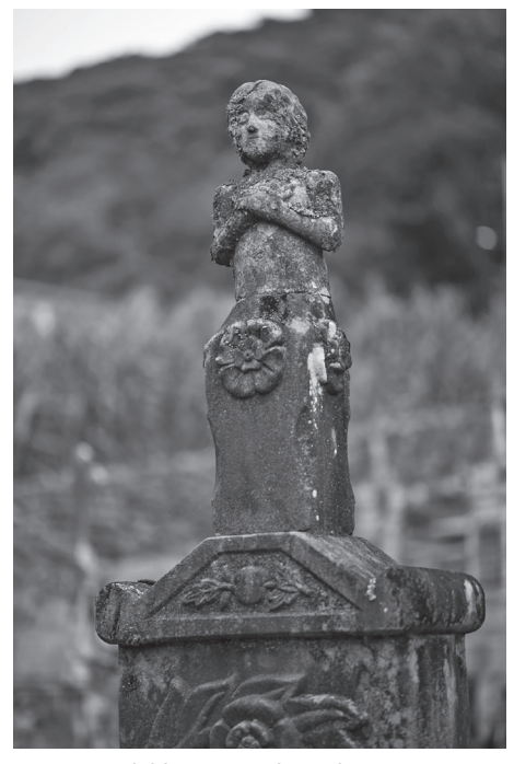
Figure 4: A child's grave in the Lutheran cemetery of Walachai (part of Dois Irmãos in the 19th century)

In analyzing the evolution of child mortality in all six Lutheran communities, we noted a significant spike in the quinquennial 1870-1874. Intriguingly, this peak coincides with the central dates of the religious-therapeutic movement of the Mucker. Starting in 1868, people from all over the northern colonies flocked to the home of Jacobina Mentz and João Jorge Maurer, located at the foothills of the Ferrabrás Mountain in Sapiranga, in search of therapies for themselves and their families (Amado, 1978; Biehl, 2008).