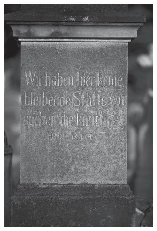
Figure 5: "Here, we don't have an enduring place, we look for a future one" – 19th century tombstone in the Lutheran cemetery of Canto Bayer (then part of São José do Hortêncio)

Historical anthropologists, historians, and demographers can indeed join efforts in identifying and exploring the potentials of hitherto insufficiently studied communal archival sources. While unearthing grassroots archives, our collaborative efforts enlarge our knowledge of the environmental and social determinants of life chances in frontier zones, while also illuminating people's arts of living and healing.