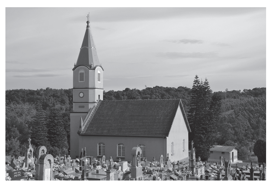
Figure 3: Lutheran Church of Picada 48, inaugurated in 1850, with tower added in 1901.

We visited six Lutheran congregations in the São Leopoldo colonial region as well as the main archive of the Brazilian Lutheran Church (IECLB). The Gemeindebücher are stored in the offices or pastoral homes of these local parishes. We photographed the books in order to carry out this study. We were unable to locate the original book from São José do Hortêncio, but had access to a transcribed copy.<sup>7</sup>