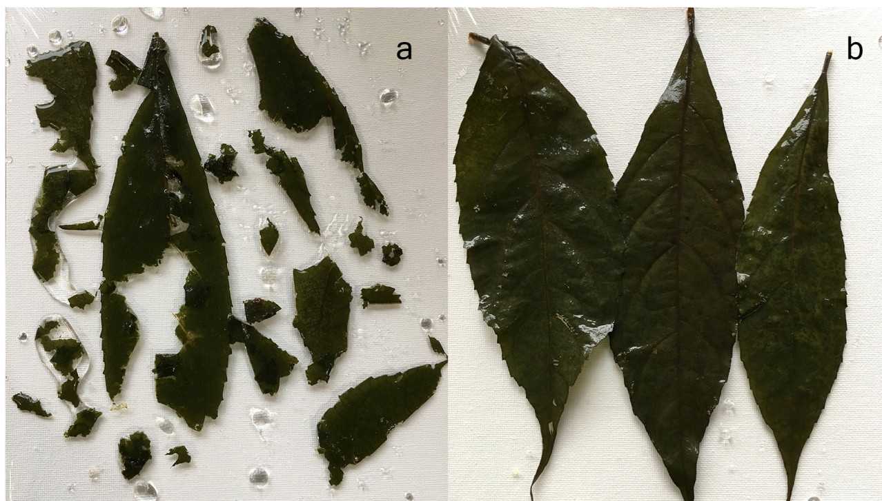
Figure 3. Koanophyllon pittieri leaves in tanks after nine days of incubation: A , Leaves in tanks with crabs ( Ptychophallus tumimanus ); B , Leaves in control tank (no crabs).