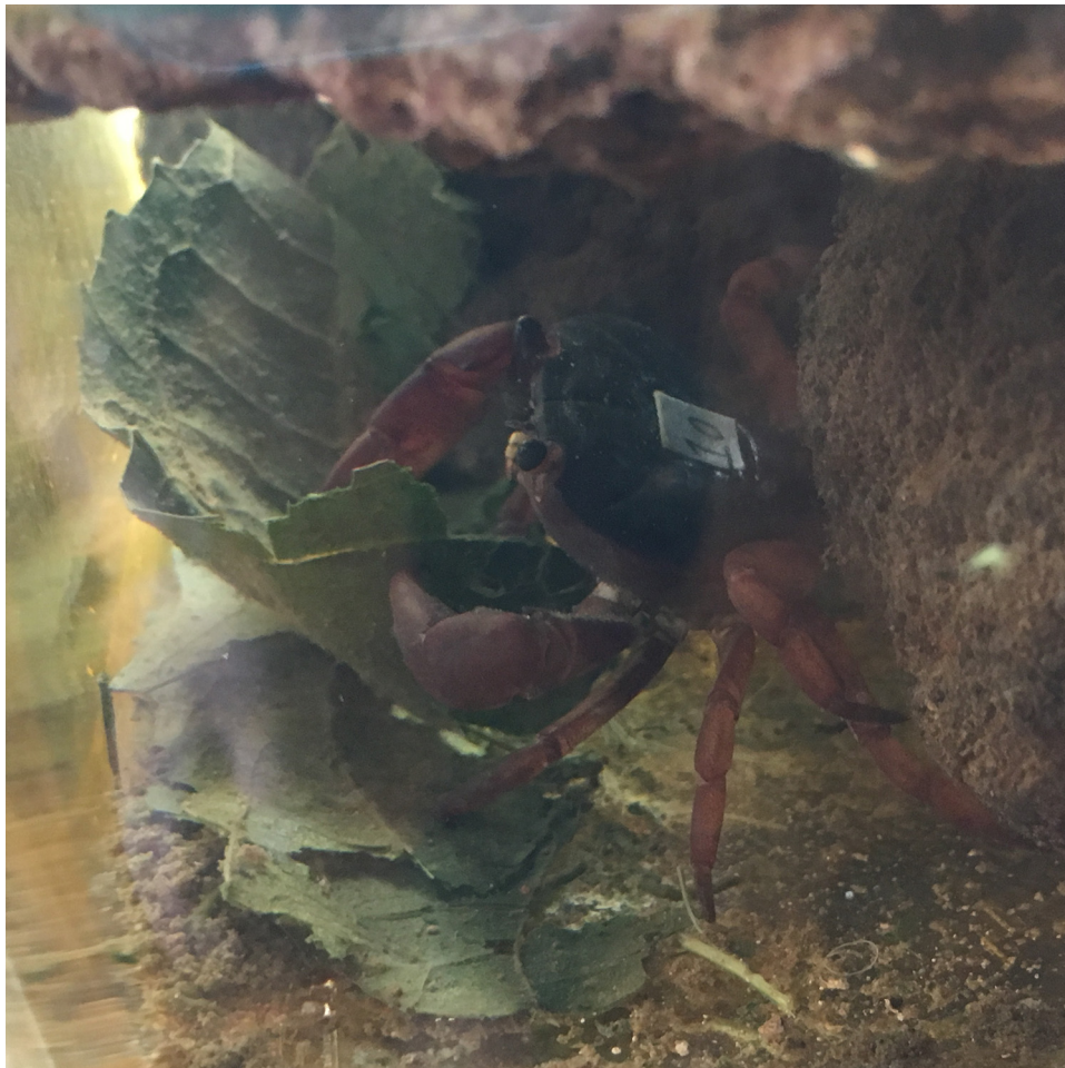
Figure 2. Pseudothelphusid crab ( Ptychophallus tumimanus ) consuming leaf material in a tank.

We visually observed and video-recorded crabs actively shredding and ingesting leaves (Fig. 2, Video S1), although all such observations occurred during the latter part of each trial; no crab consumption of leaves was recorded during the first three days of any trial. In tanks with crabs, the majority of the remaining leaf mass was composed of small fragments (Figs. 3A, 4A), whereas in control tanks, the K. pittieri leaves were still intact after nine days (Fig. 3B). We also observed crab egesta in the tanks (Fig. 4B), providing further evidence that leaves were consumed. None of the crabs molted during these experiments, so there was no change in CW, CL, or wet mass.