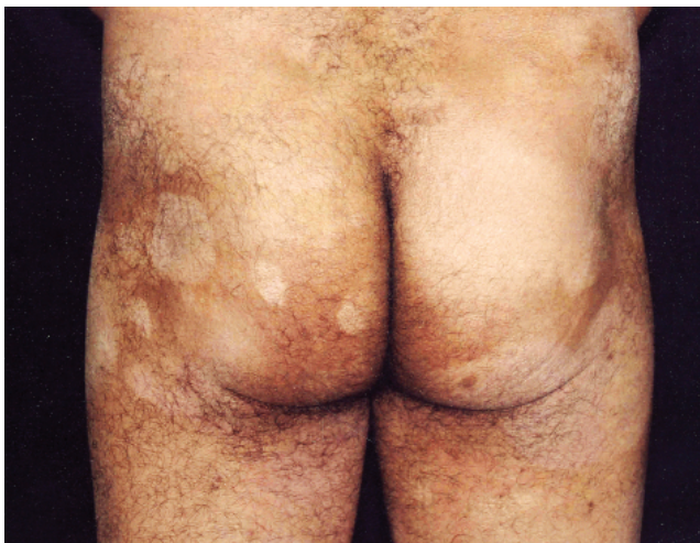
FIGURE 1: Hypochromic spots on the buttocks.

The T CD8 cell finding has been a controversial factor in relation to the prognosis, because in pagetoid reticulosis and lymphomatoid papulosis, known