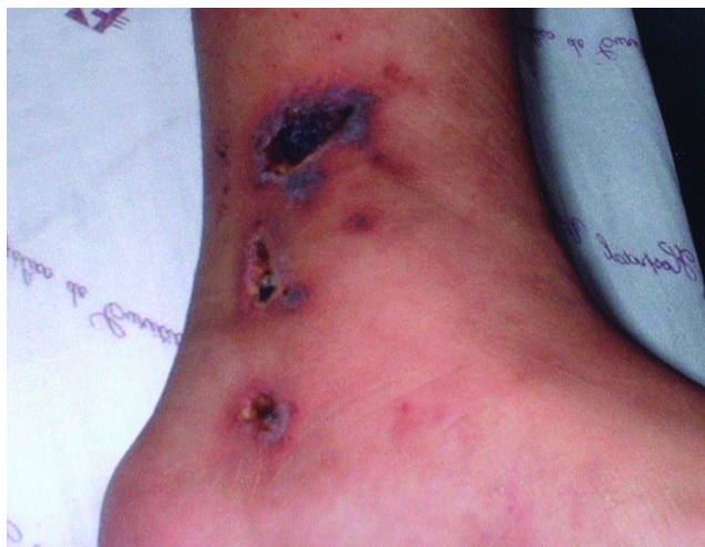
FIGURE 1: Aspect of skin ulcers before treatment