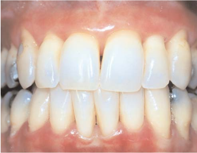
FIGURE 3: Clinical presentation of the case after continuous clobetasol propionate therapy for 15 days