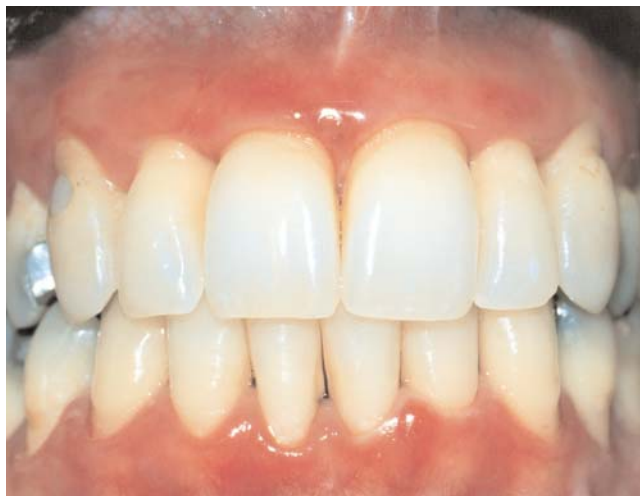
FIGURE 1: Initial clinical presentation of the case with diffuse inflammation throughout the marginal and attached gingiva. Notice an intact bulla in lower gingiva