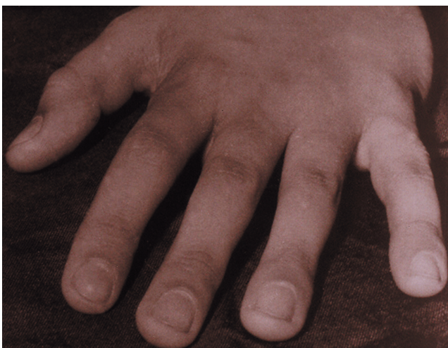
FIGURE 3: Normal nail plates after six-month treatment

In previous reports, the clinical findings seen in the nails included longitudinal grooves, purpural striations, hyperkeratosis, pustules under the nails, dense deformities or cracks in the nail plates. The patient in question had fingernail involvement that illustrated all such changes. In accordance with other reports, the authors have been able to detect a correlation between the efficacy of chemotherapy and the disappearance of the nail lesions. The complete recovery of the nail after therapy probably occurred because the nail matrix was not affected. □