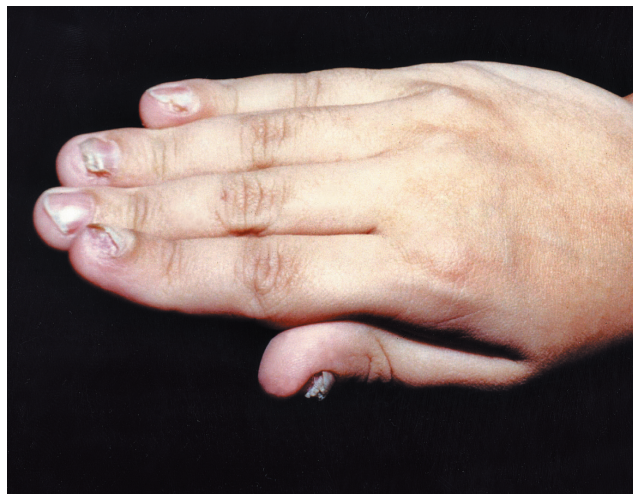
FIGURE 1: Fingernail involvement showing different degrees of onycholysis and hyperkeratosis

The mastoid bone lesions were reexamined, but the finger- and toenail lesions were not submitted to biopsy. Histopathological findings were characterized by a dense histiocytic infiltrate, made up mainly