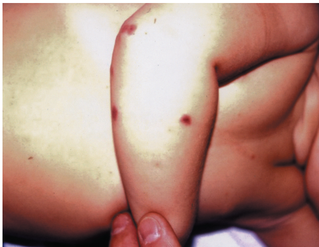
FIGURE 2: Nummular and purpuric lesions on the upper limbs

The disease affects children aged between four and 24 months, 1 and has also been reported in neonates. 2 It is believed to be a rare form of leukocytoclastic vasculitis, although it seems to be underdiagnosed or confused with an infantile form of Henoch-Schönlein purpura (HSP). In 75% of cases there is a history of recent infection, especially respiratory, or use of drugs or vaccines. 1 The occurrence of IAHE in patients with infections caused by cytomegalovirus and rotavirus was also described. 3,4