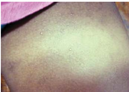
FIGURE 2: Papulous asymptomatic lesions, "milia-like", located on the thigh