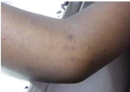
FIGURE 1: Whitish, orbicular, hard papules distributed symmetrically on the arms

symmetrically on the arms and thighs. (Pictures 1 and 2). The histopathologic exam showed orbicular areas of basophilic material in the superior dermis. (Pictures 3 and 4). Dosages of calcium and serial phosphorus and the evaluation of the renal function did not present any alterations.