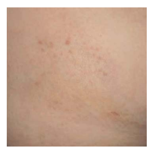
FIGURE 2: Linear erythematous plaques located on the upper abdomen