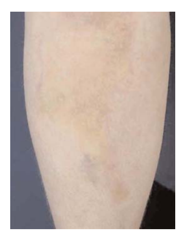
FIGURE 1: Yellowish sclerotic plaque on the right leg

Laboratory exams were all within normal limits. Evaluation of antinuclear factor (ANF) showed titers of 1:80 with a fine dotted nuclear pattern. Biopsy of the erythematous and yellowish lesions showed skin with thickening of the collagen fibers enclosing the appendages, rare perivascular lymphocytes, thickening of connective fibers in the deep dermis and moderate perivascular lymphocytic infiltrate (Figure 4). Hematoxylin-eosin staining revealed very thick elastic fibers distributed throughout the entire dermis (Figure 5). Treatment was initiated with systemic cor-