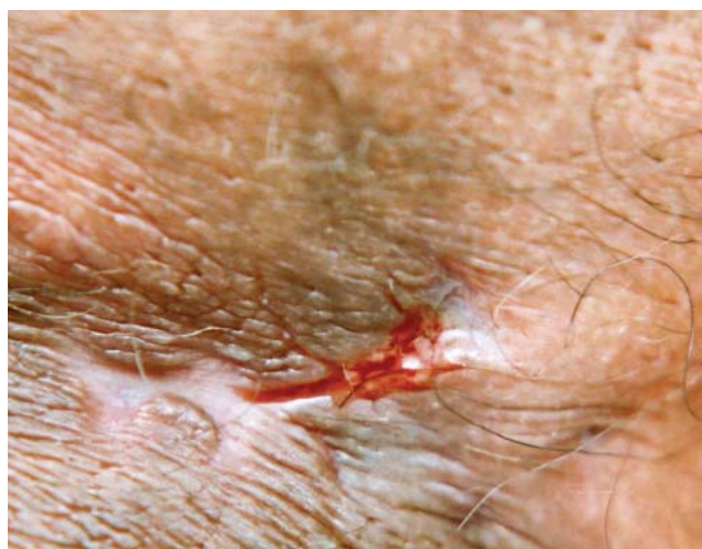
FIGURE 2: Detail of the blood and serous exudate discharge from the fistula