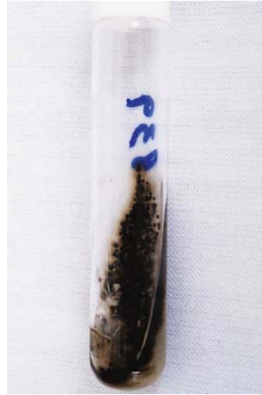
FIGURA 4: Cultura em meio Sabouraud 2%. Inicialmente demonstrou colônias de leveduras mucoides, globosas e de coloração preta