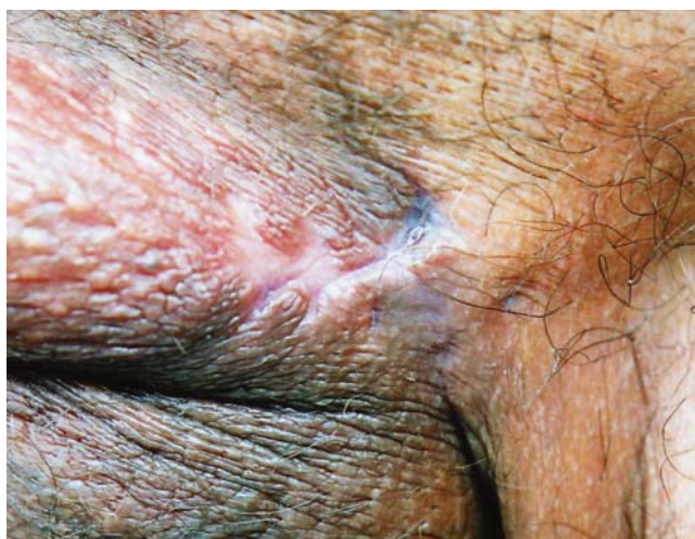
FIGURE 1: Atrophic scarring located on the left hemiscrotum

Lesions are generally confined to the upper and lower limbs, lesions on the buttocks, neck and