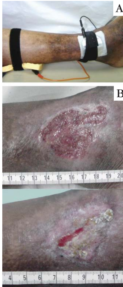
FIGURE 1: A. Photograph illustrating the procedure. B. Photograph illustrating the ulcer prior to and following treatment

A multidisciplinary team must be part of the approach used to care for patients with chronic ulcers in order to provide adequate management and coun-