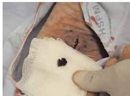
FIGURE 3: Removed foreign body - rubber

Approved by the Editorial Board and accepted for publication on 15.12.2010.