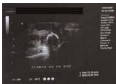
FIGURE 2: Ultrasonography of the plantar surface of the left foot showing hypoechoic nodular area with bosselated contours