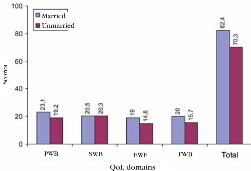
GRAPH 2: Correlation between scores in the FACT-G quality of life questionnaire and marital status

In randomized clinical trials, evaluation of QoL has been added as another dimension to be studied in addition to the efficacy and safety of drugs. Improvements in this dimension have become as important as clinical and laboratory responses to interventions, since in addition to providing information on the impact of the disease, they act as an independent predictor of survival and therapeutic