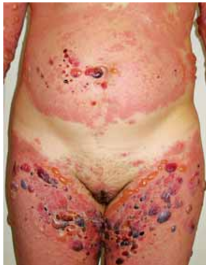
FIGURE 4: Predominant erythematous component with urticari-form lesions at the onset of the disease. Notice the areas preferably affected by the first bullous lesions; large skin folds.

A forty-three-year-old mixed-raced (pardo) female patient reported having had intense itching