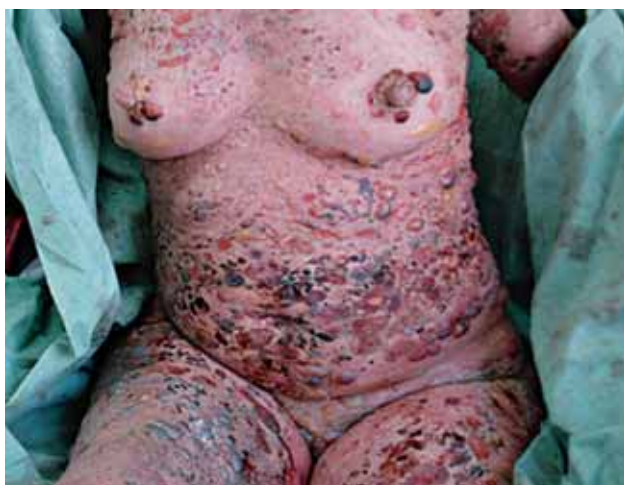
FIGURE 5: Evolution with dissemination of large, tense, sero-hemorrhagic blisters on erythematous skin. Notice that the neck has also been affected.

Source: Clinical manifestations of bullous pemphigoid