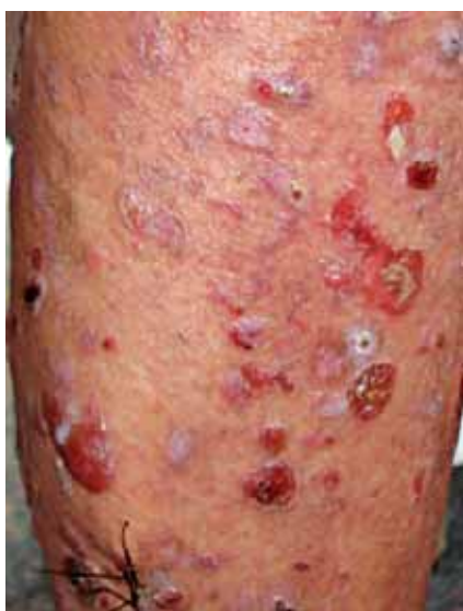
FIGURE 6: Papular, nodular lesions and lichenified plaques. Bullae are observed on some of these lesions and plaques.

associated with the onset of urticarial plaques, bullae, papular and nodular lesions. The bullae, with serous and hemorrhagic content, were located on apparently healthy or erythematous skin on the neck, trunk and limbs. The limbs also showed papular, nodular lesions and lichenified plaques (Figure 6). On some of these lesions, bullae could be observed. She had no mucosal lesions or overall poor health. The patient reported hypertension and was under treatment with captopril. The AP examination of the bullous lesion showed subepidermal cleavage with inflammatory infiltrate rich in polymorphonuclear cells. The AP examination of the papular lesion revealed hyperkeratosis, acanthosis, dermal fibrosis and superficial perivascular mononuclear infiltrate. DIF of perilesional skin (bullae)