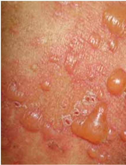
FIGURE 1: Large, tense blisters with serous content located on erythematous or apparently healthy skin

Source: Clinical manifestations of bullous pemphigoid