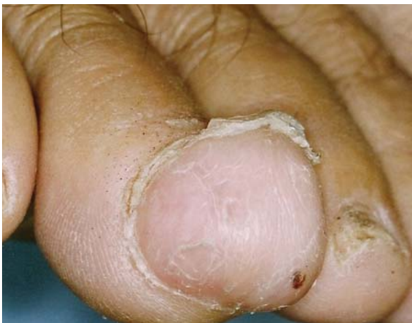
FIGURE 1: Rounded, regular, normochromatic tumorous lesion in the subungual region of the fourth toe of the patient's right foot