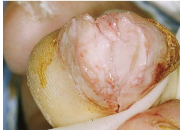
FIGURE 2: Unencapsulated, whitish, polypoid lesion occupying the digital pulp