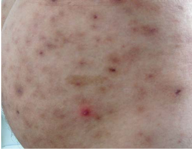
FIGURE 1: Clinical features with inflammatory papules and hyperpigmentation

This condition is characterized by multiple normochromic or hyperpigmented papules, ranging from 1 to 5 mm, that appear mainly on the chest and extre-