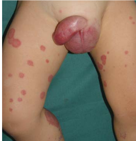
FIGURE 2: Purpuric lesions and edema of scrotum

Supplementary tests: normal leukogram, moderate anemia and thrombocytosis; urinalysis normal; coagulation tests normal. The histopathological test revealed leukocytoclastic vasculitis (Figures 3 and 4).