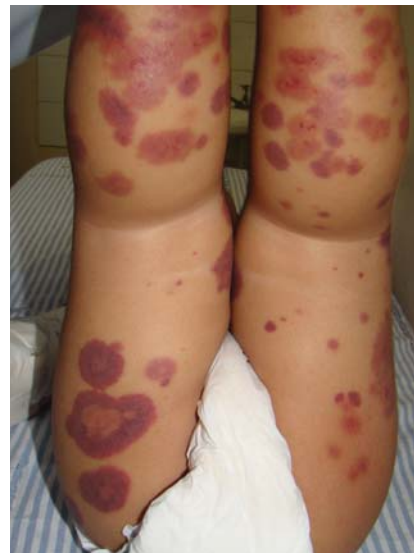
FIGURE 5: Purpuric medallion-like lesions on the lower limbs

The marked characteristic of the disease is the aspect of the lesions, similar to medallions: annular purpuric plaques with well-defined borders and central vascular patterns, located on the face and extremities. The lesions reach up to 5 centimeters in diameter, are not pruritic and a painful subacute edema is observed mainly on feet, hands, scalp and scrotum. Some may present areas of necrosis. There is contrast between the important cutaneous affection and the child's good overall health. 8-13