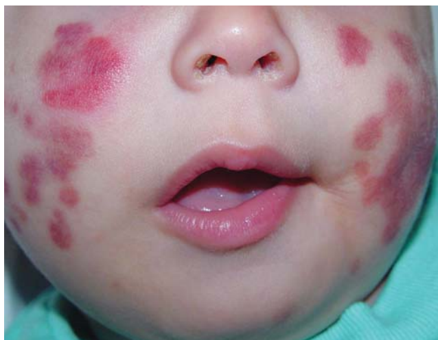
FIGURE 1: Purpuric lesions on the face and right ear

AHEI is a rare leukocytoclastic vasculitis. Ever since it was first described in 1913, approximately 100 cases of this illness have been reported worldwide. 6 Most cases occur in the winter, probably precipitated by upper respiratory tract infections, immunizations and hypersensitivity to drugs. Staphylococci, streptococci, adenoviruses, Escherichia coli and mycobacteria have also been implicated as probable triggering agents. 1,7