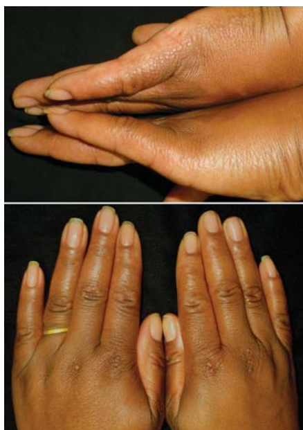
FIGURE 1: Multiple yellowish papules with a glossy surface, measuring 2-4 mm in diameter, located symmetrically on the lateral margin and the dorsal surface of both hands

A 38-year old female patient presented with multiple, normochromic or slightly yellowish papules measuring 2-5 mm in diameter, with a keratotic, glossy surface, clustered symmetrically on the dorsal-ventral axis of her hands and feet (Figures 1 and 2). There were also some papules on the backs of her hands and feet that were intensified on the bony protuberances. The lesions were asymptomatic, had appeared in childhood and had been stable ever since. The patient had had no previous treatment. Her mother and maternal grandmother had the same clinical condition at the same anatomical sites, also beginning before they reached ten years of age. Histopathology of skin revealed hyperkeratosis and acanthosis. Orcein staining revealed a reduction in elastic fibers, which were irregular and fragmented (Figure 3).