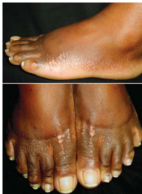
FIGURE 2: The same lesion pattern is presented on the lateral margin and dorsal surface of the foot