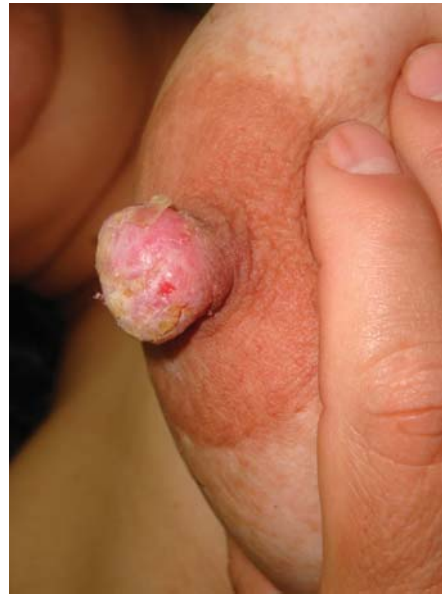
FIGURE 2: Lower view: increased nipple volume, with erythema, superficial ulceration and crusting

ma of the nipple, among others. 1, 2, 4, 5, 7-9 Currently, the most commonly used term is erosive adenomatosis of the nipple (EAN). 2