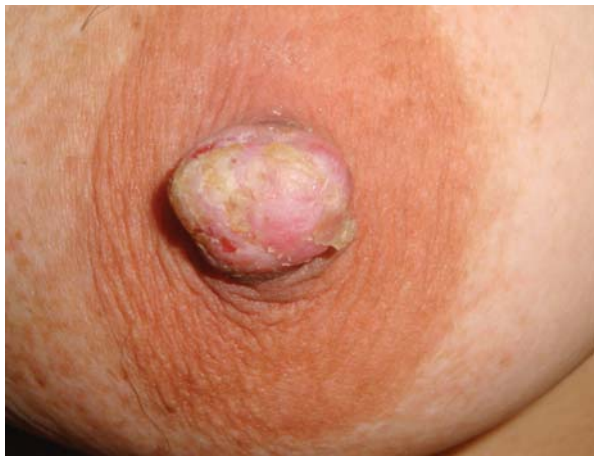
FIGURE 1: Front view: increased nipple volume, with erythema, superficial ulceration and crusting

Initially described as florid papillomatosis of the nipple (FPN), the disease has been known by many names since it was first reported by Jones in 1955. 4,8 In 1962 Handley and Thackray questioned Jones' findings because the original micrographs showed an adenomatous lesion. 1 Shortly afterwards, Le Gal called the condition "erosive adenomatosis" because of the erosive nature of the lesion. 1,2,4,9 The following names can be found in the literature: erosive adenomatosis of the nipple, papillary adenoma of the nipple, florid adenomatosis, florid papillomatosis of the nipple, subareolar duct papillomatosis, superficial papillary adenomatosis of the nipple and adeno-