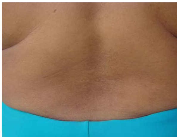
FIGURE 3: Reddish-brown, lace-like macules in the sacral region