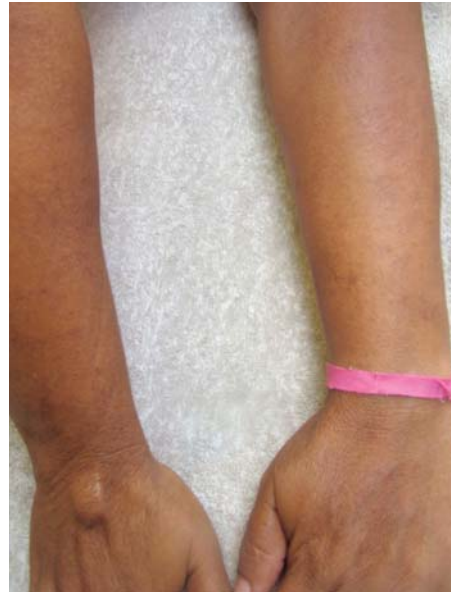
FIGURE 1: Reddish-brown, lace-like macules on the arms

Primary cutaneous amyloidosis (PCA) has an incidence that varies significantly with ethnic origin and is more common in South America and Asia than in North America and Europe. This suggests that