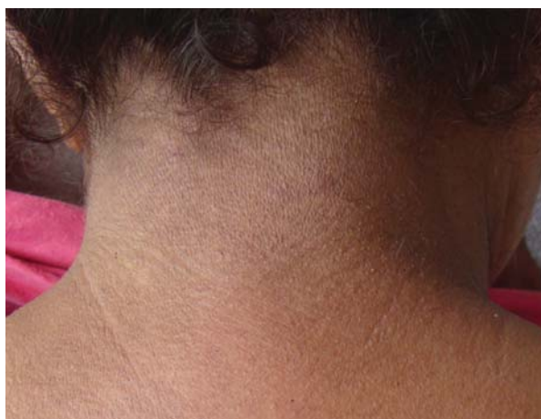
FIGURE 4: Reddish-brown, lace-like macules on the back of the neck

Occasionally, MA and lichen amyloidosis may coexist in the same patient, a condition known as biphasic amyloidosis. There are also reports of rare hypochromic and poikilodermatous forms 4 .