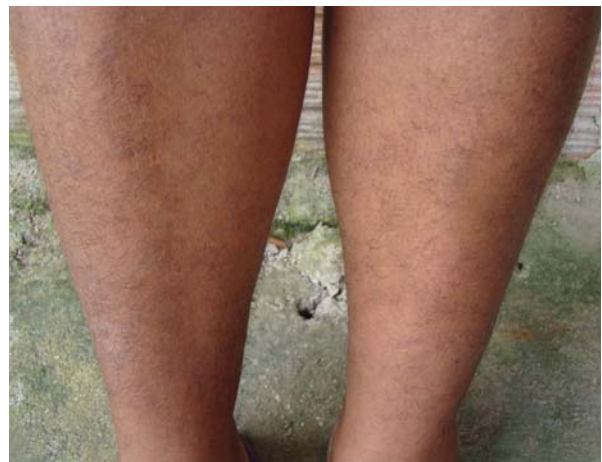
FIGURE 2: Reddish-brown, lace-like macules on the legs

genetic, environmental and even cultural factors may be implicated in PCA. 7 This type of amyloidosis is more frequent in females, particularly those in the 21- to 50-year age range, suggesting that hormonal factors may be involved in the etiopathogenesis of the disease. 2 The patient described here is South American and lies in this age range.