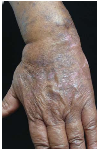
FIGURE 3: After 5 months of treatment with significant improvement of relief and dyschromia