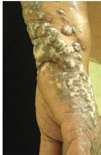
FIGURE 2: Verrucous plaques with purplish grey outskirts and hypochromic center