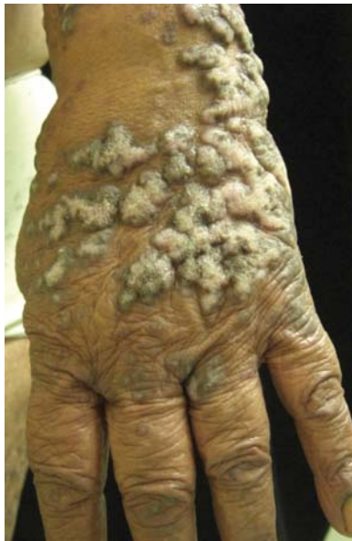
FIGURE 1: Back of the left hand showing verrucous plaques, confluent, with irregular borders and well defined limits

HLP usually presents itself clinically as papules and symmetrical plaques, with lichenified and highly hyperkeratotic surface with coloration that varies from purple to gray having a predilection by the pretibial