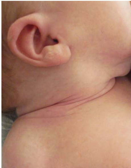
FIGURE 1: Subcutaneous nodules in the right cervical region

Hard subcutaneous nodules on the back and bilateral cervical region, developed over approximately 5 days, were observed in the hospital emergency room at 13 days after birth. Physical examination revealed the presence of hard oval-shaped subcutaneous nodules measuring approximately 4x2 cm in the cervical region bilaterally and a 10 cm long string of nodules on the upper right part of the back. The overlying skin was normal (Figures 1 and 2). The