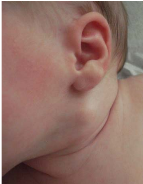
FIGURE 2: Subcutaneous nodules in the left cervical region

remaining physical examination of the child was normal.