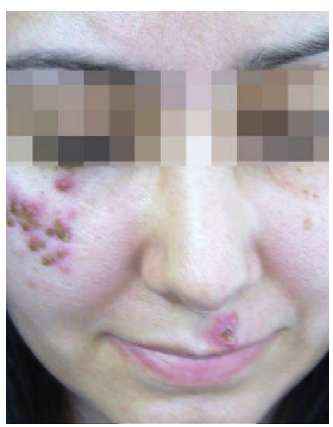
FIGURE 1: Case 1 -Papules and pustules located above the lip and on the malar area;

Case 2: 60 years old female, married, housewife, mother of patient 1, who lived in the same house. During consultation with the dermatologist she presented with an infiltrated, erythematous plaque on the distal third of the right arm, one month after being scratched by a domestic cat (Figure 2A). Sporotbrix schenckii was isolated from culture. The histopathologic examination showed hyperkeratosis, spongiosis, pseudoepitheliomatous hyperplasia and exocytose of leucocytes. The papillary dermis showed mixed inflammatory infiltration with foreign body giant cells and microabcesses. Staining for fungus with PAS and Grocott were negative. The patient received saturated solution of potassium iodide (dose: 3 g/day) with healing of the lesions in three months.