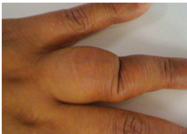
FIGURE 1: Nodule on the dorsum of the proximal phalanx of the left fourth finger. Approximately 3 cm in diameter, with soft consistency, not adhering to deep planes