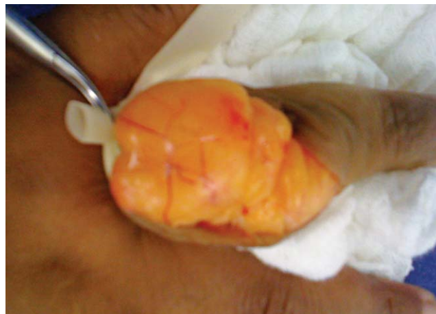
FIGURE 2: Resection of the lesion

Female patient, white, 37 years old, reported a nodule on the dorsum of the proximal phalanx of the left fourth finger after trauma at age 12. The lesion had grown slowly bigger over the previous two years. Diabetic patient with adequate glycemic control. Examination revealed a nodule of about four inches in diameter on the dorsum of the proximal phalanx of the left fourth finger, of a soft consistency, not adhering to deep plane and painless to the touch (Figure 1). Patient complained of mild limitation of movement in the affected finger since the lesion had increased in size. After initial diagnostic hypotheses, we carried out fine needle aspiration which confirmed our suspicions. In view of the patient's complaints about limitation of movement and the fact that the lesion was unsightly, it was decided, together with the patient, to perform surgery to remove the tumor (Figure 2). Pathology exam confirmed the diagnosis (Figure 3).