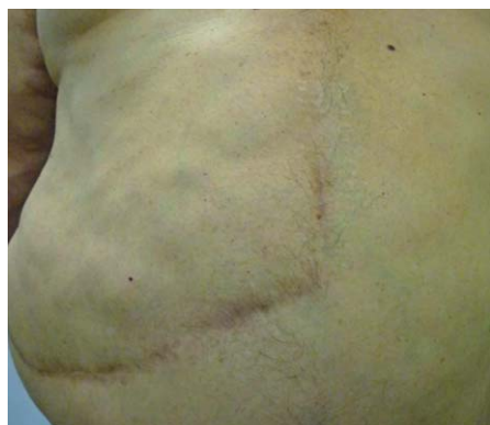
FIGURE 1: Multiple subcutaneous lesions in the abdomen

lesions were observed in his two brothers and father. Some lesions were surgically excised because they caused functional discomfort. The histopathological examination showed the presence of globules of mature white adipose tissue surrounded by thin fibrous capsules. The analytical study showed no significant abnormalities including lipid abnormalities. Based on the characteristic clinical history, family history and histopathology the diagnosis of familial multiple lipomatosis (FML) was made.