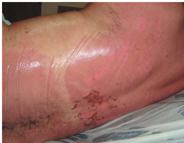
FIGURE 5: Fifth day of IVIG, showing almost complete reepithelization

ed, as also shown in other studies that obtained no benefit.