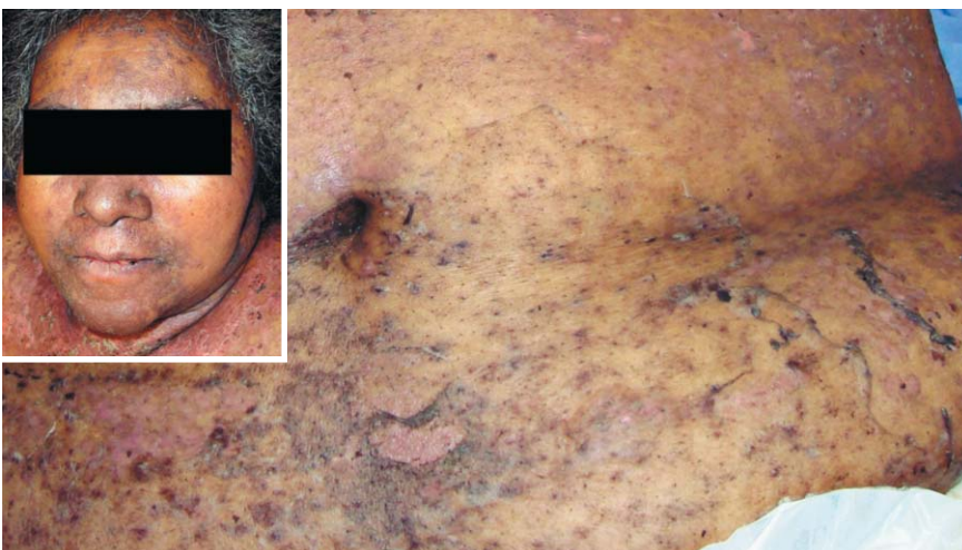
FIGURE 3: Third day of IVIG, with partial reepithelization

Prospective open studies and case series show evidence on IVIG use in SJS/TEN. Among studies that demonstrated no benefits of IVIG, the largest included patients with chronic renal failure and age >60, factors associated with greater basal mortality, and probably, bad response to IVIG. 7 Many patients received 2 g/kg of IVIG, a dose lower than presently recommend-