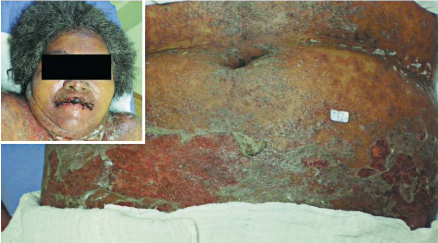
FIGURE 2: Fourth day of the disease. Oral involvement and areas of ulceration on the trunk