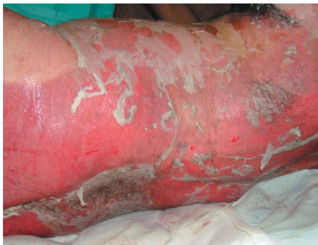
FIGURE 4: Eighth day of evolution, first day of IVIG. Large denuded areas on posterior trunk