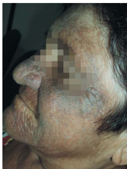
FIGURE 2: Blue-black macules and papules on the face