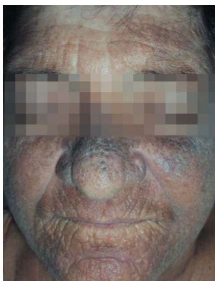
FIGURE 1: Blue-black macules and papules on bilateral malar region, forehead, chin and dorsum of nose

Clinically it presents as brown-gray or blue-black pigmentation, asymptomatic, in photoexposed